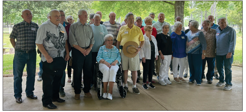
Hueytown High School Class of 1962