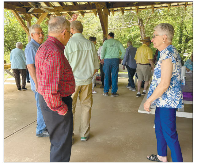
Former classmates enjoying their reunion at Brackner Park