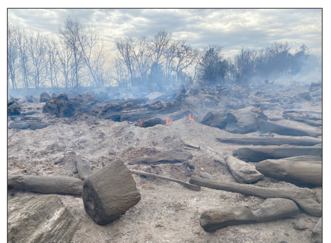
Debris fire near old Muscoda Mines