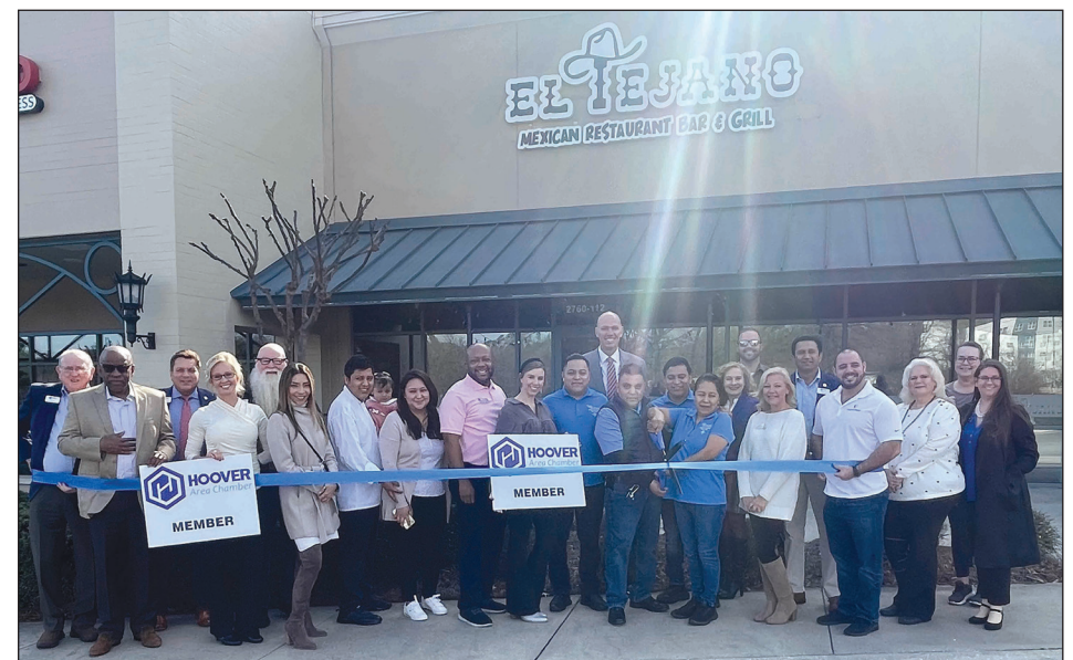
Recently marked a momentous occasion as El Tejano celebrated its ribbon-cutting and grand opening. This vibrant event brought together the community, and the Hoover Chamber is thrilled to witness the growth of another family-owned and operated business joining our thriving network.