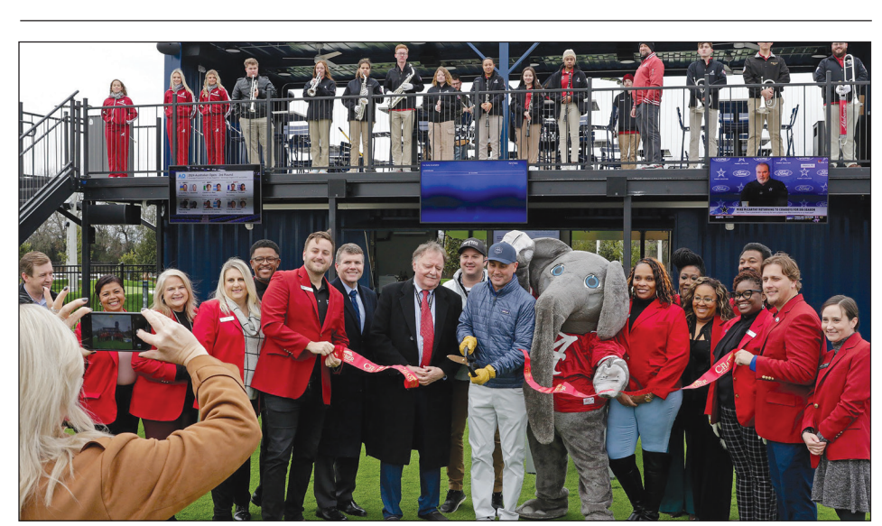
The wait is over, and the putting greens are calling your name! With the recent ribbon cutting, PopStroke Tuscaloosa is open for business. Pop-Stroke features two 18-hole putting courses designed by Tiger Woods plus great food, a beer garden with outdoor games and more. Welcome to Tuscaloosa, PopStroke!