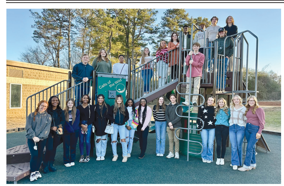
Members of the Hueytown Junior Ambassador Program

Volume 186 | Issue 38 | 75¢ February 2, 2024