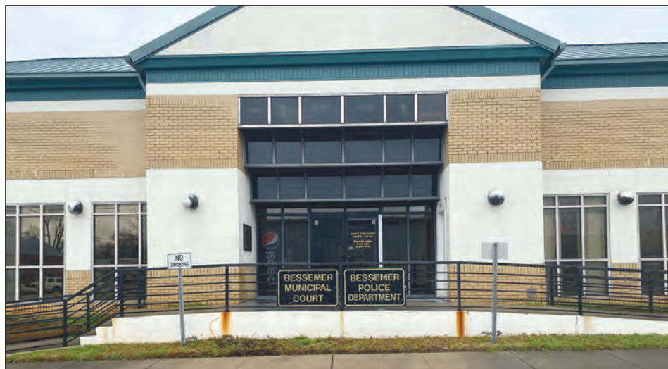
Bessemer Police Department