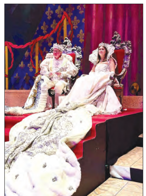
King Frederick and Queen Mary