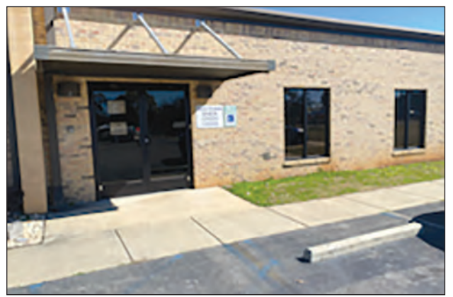
Hueytown Senior Center

For more information on the Senior Center, call 205-491-7052.